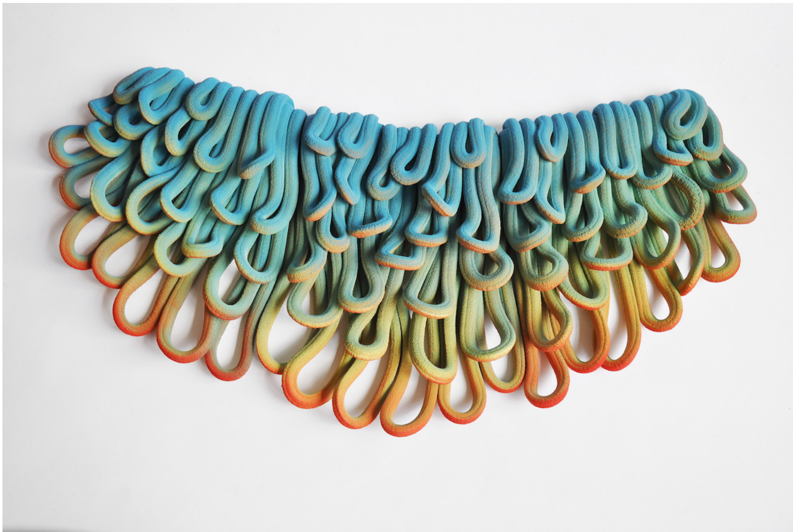
Claire Lindner Curtain fall, 2022 gres smaltato glazed stoneware 45 x 10 cm (17,72 x 3,94 in)